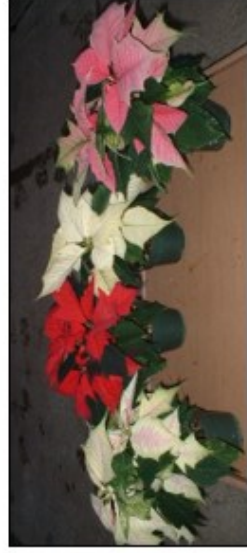
4" and 6.5" Poinsettias

Proceeds are used to buy library resources for all students, in all grades, in all subjects